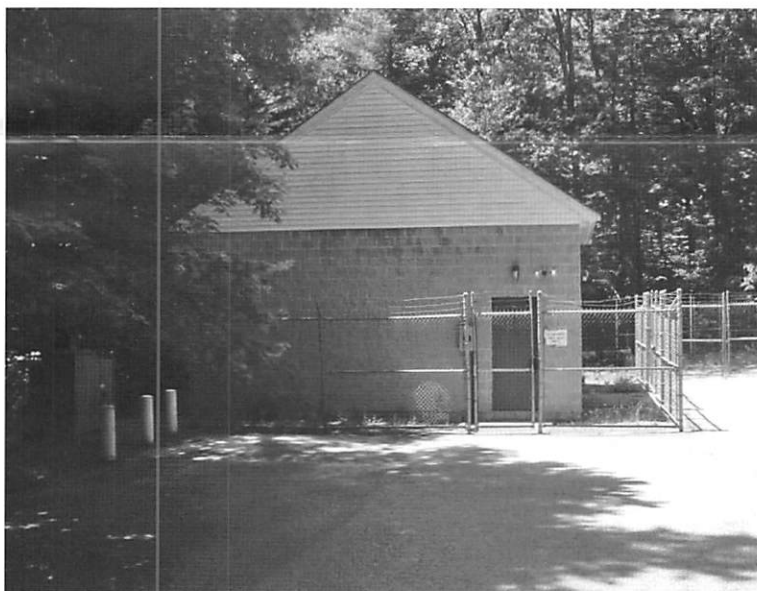
Glen Street Pump Station