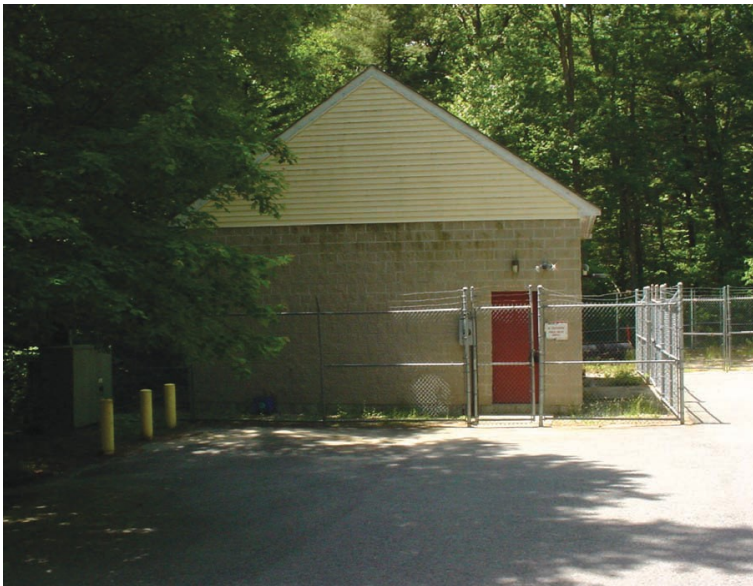
Glen Street Pump Station